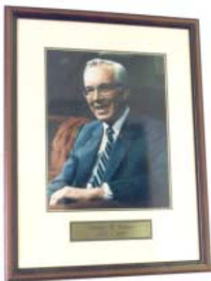
The portrait that is located on the first floor of Heller Hall.

We at Minnesota are certainly glad he was here.