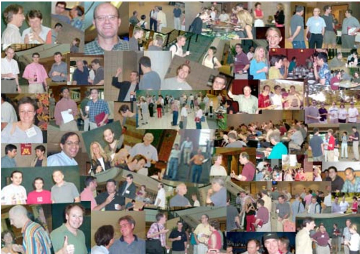
Scenes from the Minnesota Workshop in Macroeconomic Theory